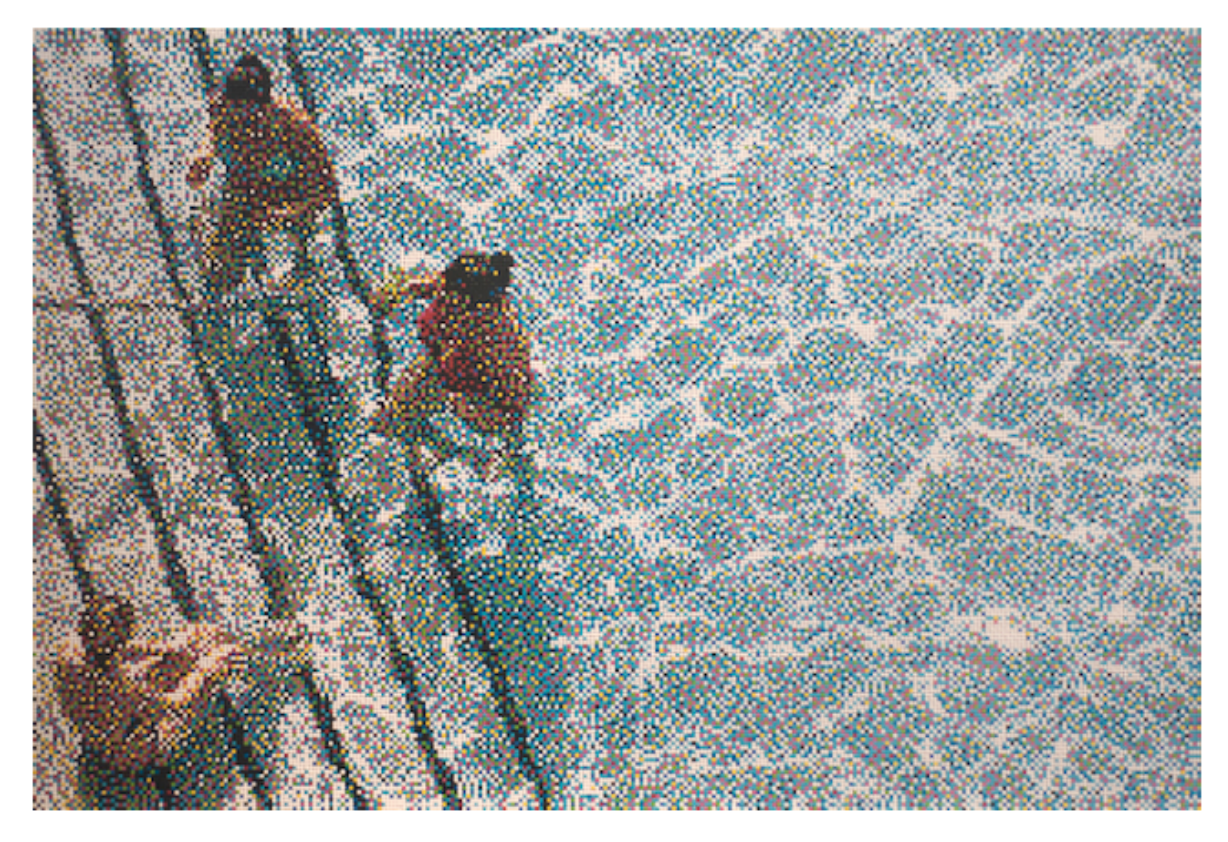
William Betts, Untitled Swimming Pool XIX, 2016. Acrylic on canvas, 48 x 72 inches (122 x 183 cm).

Betts plays with the clash between voyeurism and recreation. "There is a distance to it," he explains, "there is a removal. And when I see the show, when I walk through the show, there's a little creepy factor to it. But I don't want that to be overwhelming. There is this omnipresence now of cameras, of people taking pictures everywhere. I really want to explore that a little bit because on the one hand it's very approachable, and some of that feeling may get lost because of how approachable [the paintings are], but to me these issues are pretty deep and pretty serious."