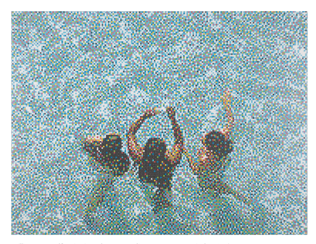
William Betts, Selfie Miami Beach, 2016. Acrylic on canvas, 36 x 48 inches (91.5 x 122 cm).

Betts says SPLASH is about "the idea of privacy, how everywhere we are we're kind of on camera somewhere. I liked the idea of swimming pools and beaches because they're places where we make ourselves very vulnerable. We're virtually naked. And we're playing around, having a great time, but from a physical standpoint we're very vulnerable. And yet we also make exceptions of privacy. It's kind of a metaphor for how we treat our privacy. It's kind of carefree and we take it very casually. I find the idea of using beaches and pools as a wonderful metaphor for the way we're happily giving away our credit card information to people and yet we lock up our bicycles. That's kind of a strange thing to me."