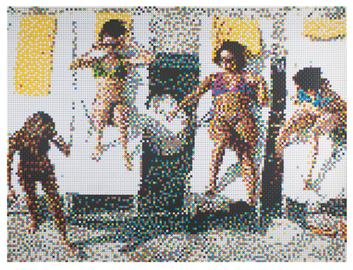
William Betts, Sunbathers, Miami Beach, 2016. Acrylic on canvas, 52 x 70 inches (132 x 178 cm).

subjects at play, and then converts those images into pointillated works using a CNC machine. The result is a happy moment captured through a hidden lens, in which the artist calls into question everything we take for granted while out enjoying a sunny day. Phoning in from his home in sunny Miami Beach, Betts tells us about the illusion of privacy and mixing the mundane, the cheerful, with the sinister.