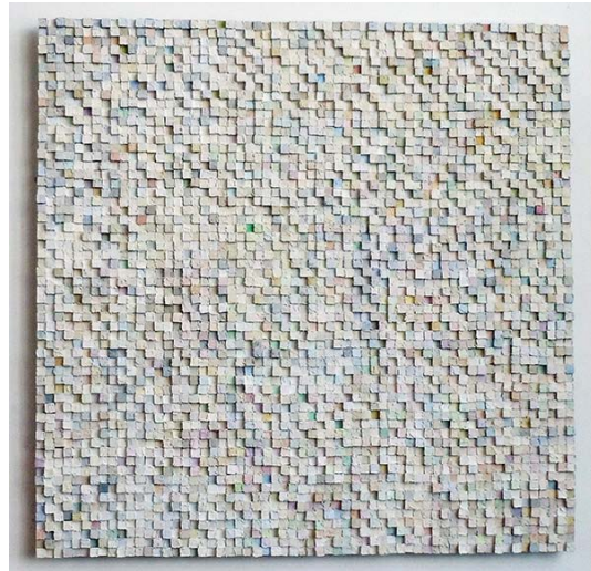
Silent Solitude , 2011, Wax, limestone dust, olepasta and pigments on wood, 35 x 35 inches, 88 x 88 cm)

The playful transparency of process is the key to viewer enjoyment here. In creating his own rules, Estrada-Vega is able to squeeze a healthy dose of magic out of what could have been just another sterile abstract grid. Utilizing an acute attention to material within a self-defined process of mark making, he creates his own aesthetic oasis in what could have been just another dune in a well-traversed painting desert.