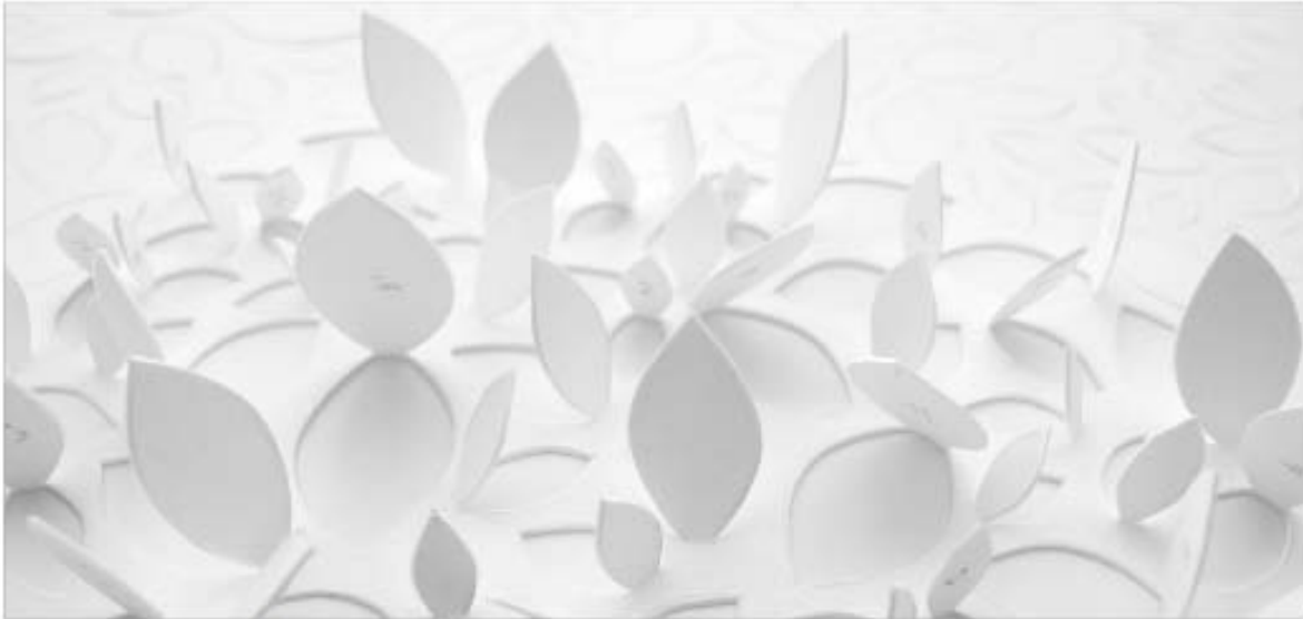
Archetype, 2011, Hand-cut paper (10,972 cuts), 42" x 42"