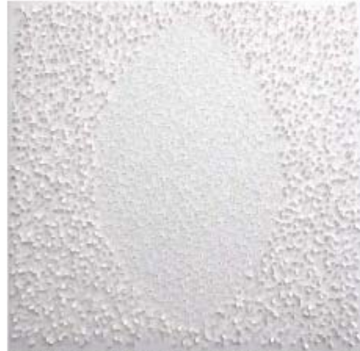
Form Is Empty , 2011, Hand-cut paper (5,832 cuts), 42" x 42"

“I thought, what happens if I just remove the matter from this sheet of paper?”