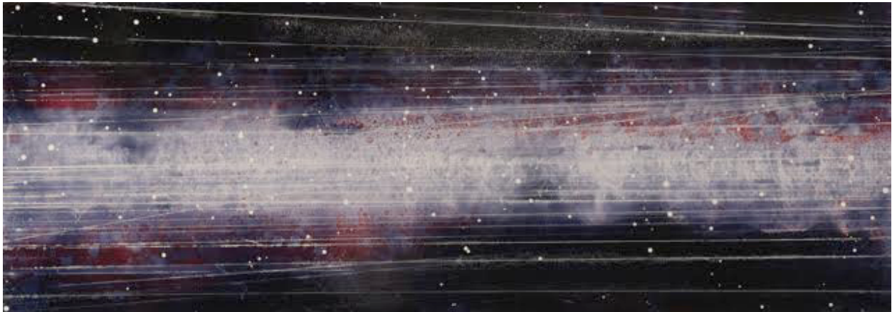
David Mann, Trans , 2015 Oil and alkyd on canvas, 27.25 x 76.25 inches (69 x 194 cm)

Of the three, Lux is perhaps the most strongly pictorial in effect, with an explosion of amber light emanating from a single point off center that sends illuminated tracers to all corners of the painting. It strongly evokes a powerful cosmic event.